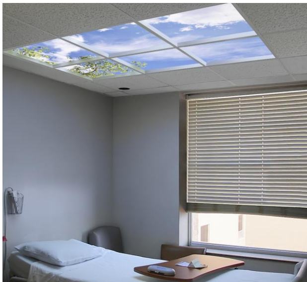
Patient room Luminous SkyCeiling at Covenant Health.

September 21, 2015 – The October issue of the Health Environments Research & Design Journal features a new study by Texas Tech University in collaboration with Covenant Health and the Sky Factory that examined the positive impact of Luminous SkyCeilings on acute stress and anxiety in a controlled clinical setting.